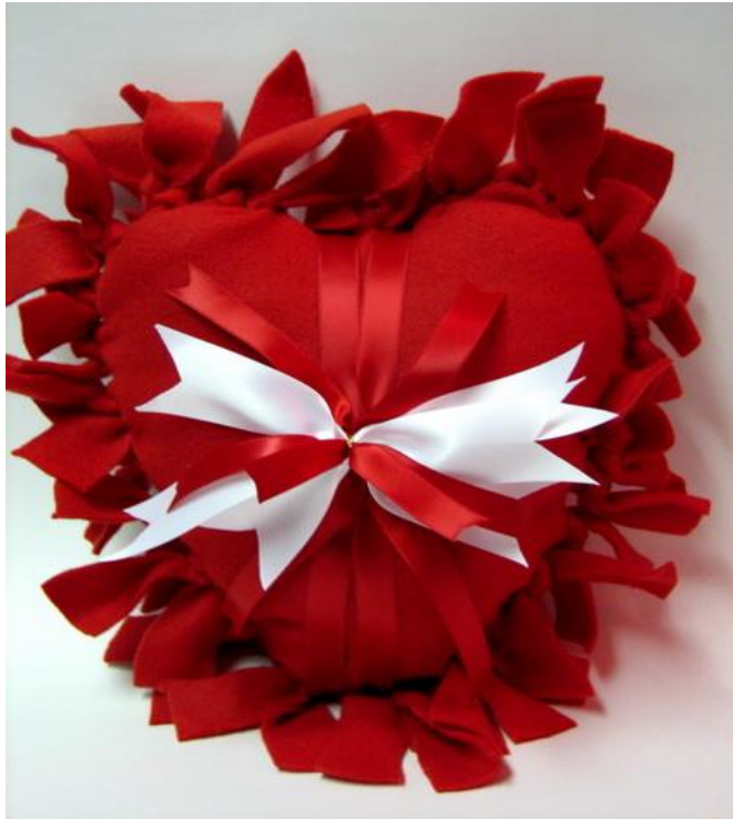
Valentine “No” Sew Pillow